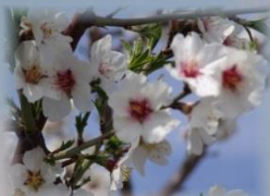
Mandulavirág * Almavirág