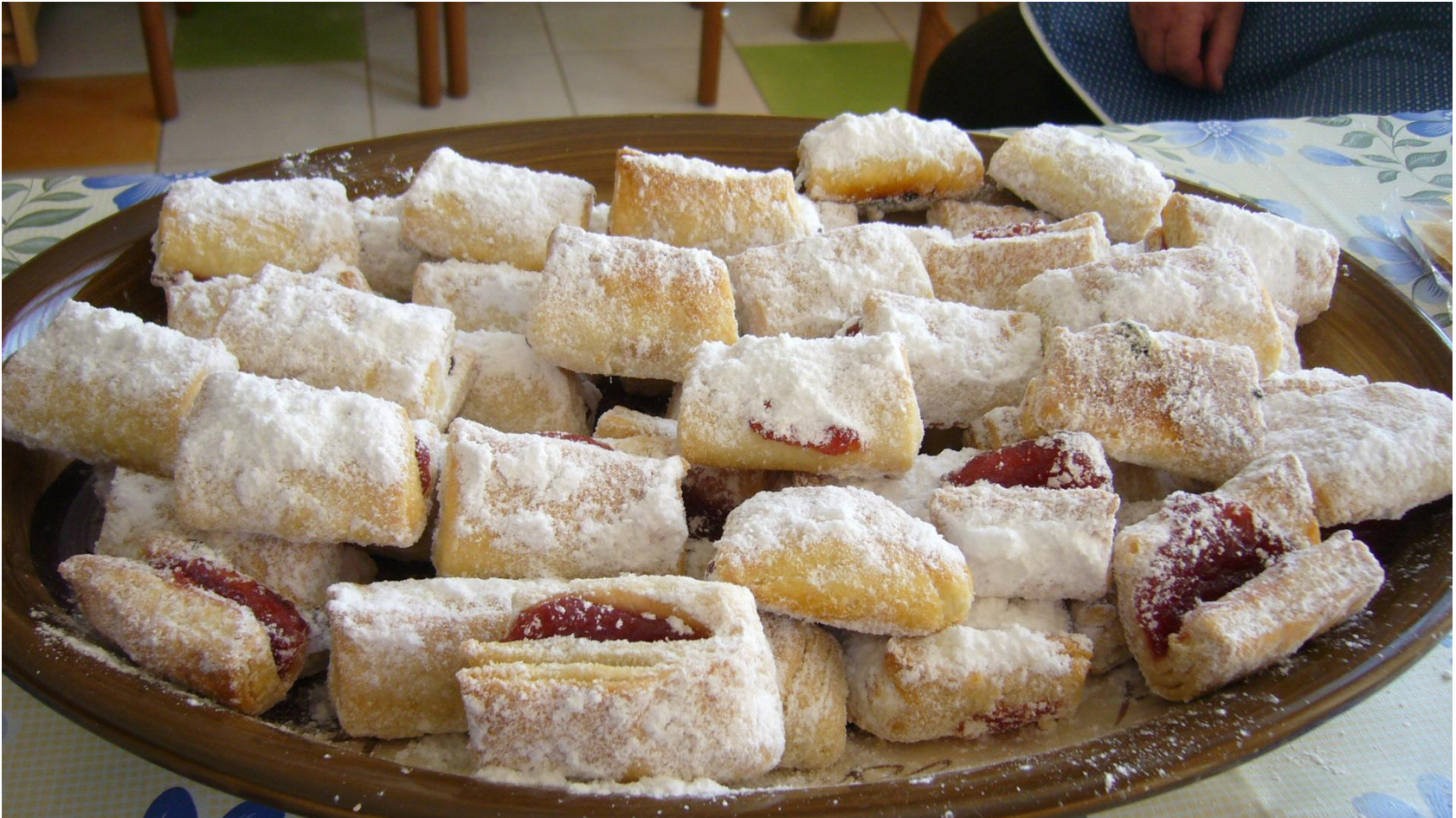
Home baked paloc sweets

A település-marketing szerepe Kozárd integrált turizmusfejlesztésében