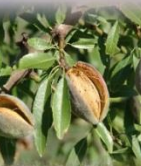
Fuji KIKU8 alma * Carmen körte * Orange red kajszi * Gála Galaxy * Bluefrej szilva * Mandula