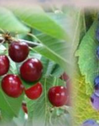
Kajsziifürt * Cseresznye * Szőlő